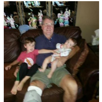
Lay Director for 2017